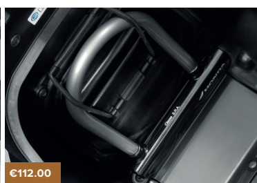
U-LOCK 123/217 08M53-MEE-800

Facilitates cleaning and rear wheel maintenance plus allows for more secure parking on uneven surfaces.