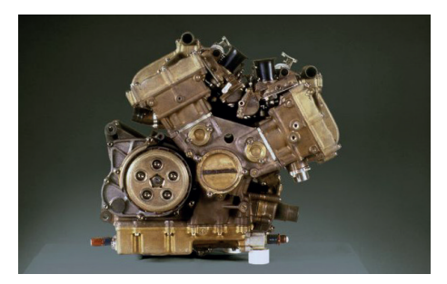
The first Honda V4 engine developed in 1978 for the Road Racing World Championship

The love story between Honda and the V4 4-Stroke DOHC engines started 40 years ago. Designed to challenge the 2 strokes dominating the Road Racing World Championship, the NR500 started the lineage of Honda bikes sharing the DNA rooted in the Crossrunner: the unique flexibility, smoothness and purity of output provided by a V4 engine.