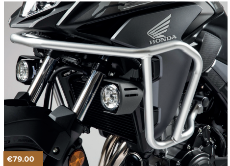
FRONT SIDE PIPE 08P72-MKP-J80ZA

Improve the protection and gives a mounting for the fog lights (sold separately)