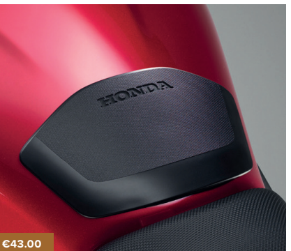
TANK PAD 08P70-MGH-J20

Tubular aluminium anodised cowl decoration kit developed to emphasize the bikes rugged appearance.