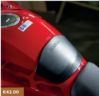
TANK PAD 08P70-MGH-J20

Improve the protection and gives a mounting for the fog lights (sold separately)