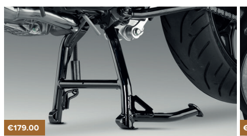
MAIN STAND KIT 08M70-MGS-D30

Facilitates cleaning and rear wheel maintenance plus allows for more secure parking on uneven surfaces.