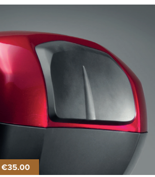
BACKREST PAD FOR 31L TOP BOX 08F75-MGE-800

Additional pillion backrest pad that mounts on the top box lid.