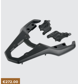
REAR CARRIER 08L71-MGZ-D80ZA

35-liters Top Box designed to be operated with your CB500X key. This set includes the rear carrier and the base needed to mount the top box on the bike. The key system is also included.