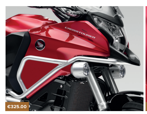
COWL GUARD KIT 08P71-MGH-J20

Tubular aluminium anodised cowl decoration kit developed to emphasize the bikes rugged appearance.