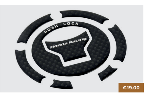
FUEL LID COVER 08P61-MJM-800A

Adhesive-backed tank pad helps to protect tank paintwork from scratches and rubbing.