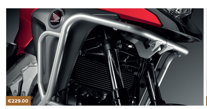
COWL GUARD 08P70-MJM-D60ZA

Required for installation of the LED Fog light.