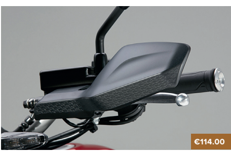
KNUCKLE GUARD KIT 08P70-MJM-D40

This attachment is required in order to install the LED front fog lights.