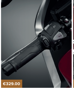
HEATED GRIPS 5-STEP & ATTACHMENT 08T72-MGH-N13

5 position temperature adjustment. Wiring harness connecting to the inside of the cowl for easy set up. Auto heater-off function, activated by holding switch 2 seconds.