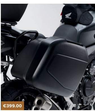
PLASTIC PANNIERS SET 08L70-MGZ-D80

Sturdy rear carrier with integrated pillion grab rails.