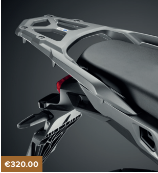
REAR CARRIER BRACKET 08L70-MJM-D60ZA

Features black zippers and black Honda Wing logo plus adustable shoulder strap and carrying handle.