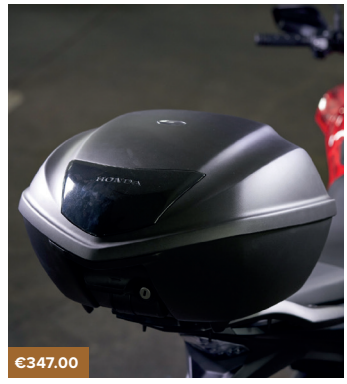
35L TOP BOX 08ESY-MJX-TBWK

35-liters Top Box designed to be operated with your CB500X key. This set includes the rear carrier and the base needed to mount the top box on the bike. The key system is also included.