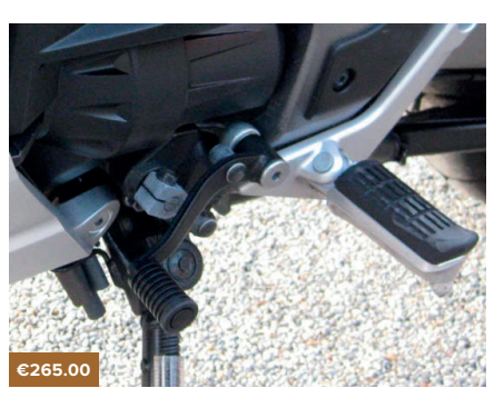
DCT FOOT SHIFT KIT

Delivering great looks and increased performance, this street legal Slip-on Exhaust features laser engraved Akrapovič logo, and conforms to all exhaust system noise level regulations for street use.