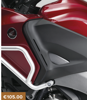
SIDE DEFLECTOR KIT 08R70-MGH-J20

5 position temperature adjustment. Wiring harness connecting to the inside of the cowl for easy set up. Auto heater-off function, activated by holding switch 2 seconds.