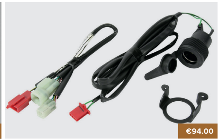
12V ACCESSORY SOCKET 08U70-MJM-D00

Set of two knuckle guards to further improve rain and wind protection.