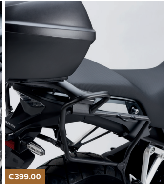
PANNIERS STAY 08L70-MGZ-D80

SA set of two aerodynamically shaped panniers especially designed to look fully integrated on the CB500X.