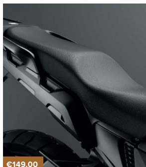
LOW SEAT 77200-MGH-N20MA

Set of L&R fairing deflectors in black polyurethane which strongly minimise rider and pillion turbulence.