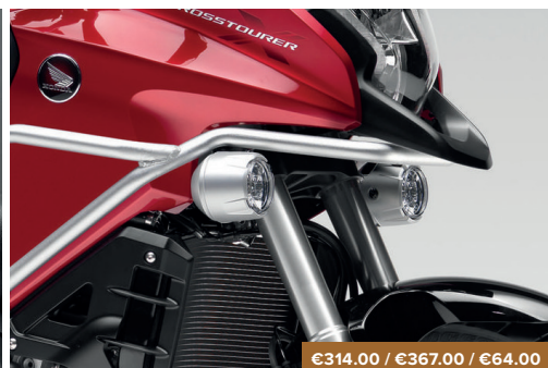
FRONT LED FOG LIGHTS 08V72-MGS-D30

Pair of adjustable, bright white LED Front Fog Lights, for those gloomy days and nights or when riding in fog. Must be combined with Fog Lights Attachment Kit (08Y70-MKA-D80), Cowl Guard (08P71-MKA-D80), and Relay Kit (08A70-M6S-D30).