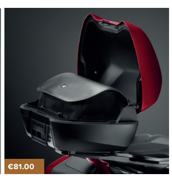
TOP BOX INNER BAG 08L56-MGE-800A

Additional pillion backrest pad that mounts on the top box lid.